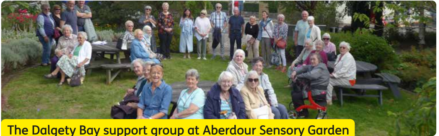
The Dalgety Bay support group at Aberdour Sensory Garden

Volunteers like you are keeping our Macular Society community going, come rain or shine.